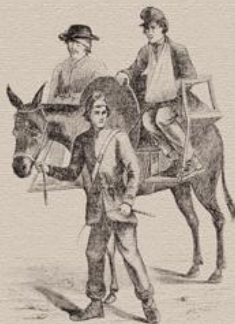
Wounded men transported by cacolets.

The high mortality from injuries is secondary to injuries from the bullet that was used. The Minie ball, named after the French captain who first developed it, was a slow, heavy, soft-lead projectile, which penetrated a body at a velocity of