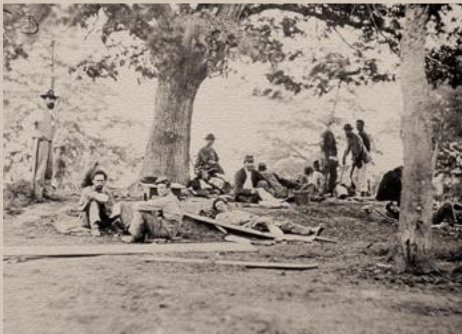
First aid station.

"If one wants to learn surgery, one must go to war," Hippocrates wrote. The number of deaths surrounding the Civil War is staggering. Of the nearly three million soldiers who participated in the conflict, approximately 618,000 died—two-thirds by disease, one-third in battle. The total mortality of the war represents the loss of 2 percent of the entire United States population at that time. Union statistics document the treatment of almost one-half million injuries and six million cases of illness. Nearly 500,000 men came out of the war permanently disabled. In Mississippi, in 1866, one-fifth of the state's revenue was spent on artificial limbs. Of the 12,344 surgeons in the Union medical corp, 336 were killed in the line of duty or died while in service. In his manual for military surgeons, Chisolm wrote, "the surgeon on the battlefield must participate in the dangers."