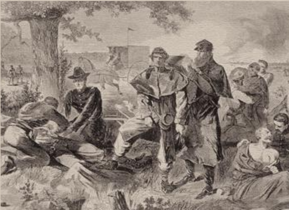
The Surgeon at Work at the Rear During an Engagement by Winslow Homer.

In June 1861, two men met in New York with a group of devoted women, including Dr Elizabeth Blackwell, the first female physician in the United States. They formed the Women's Central Association of Relief for the Sick and Wounded. On May 16, delegates of this group descended on