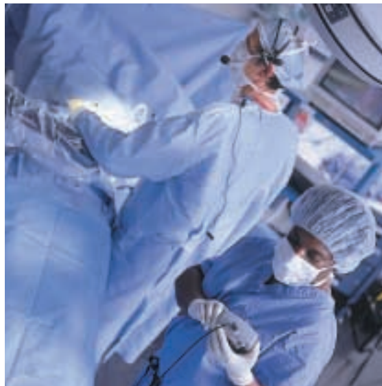
© Computer Motion news Bobbi Bennett