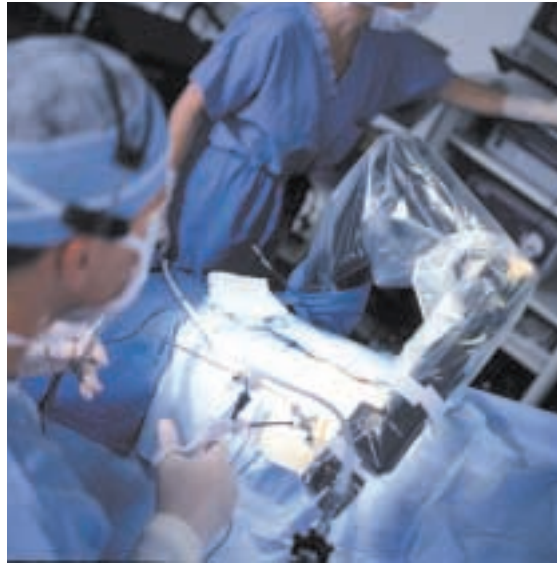
© Computer Motion news Bobbi Bennett

The remote surgical manipulator brings with it unprecedented technology and application for the realm of surgical intervention. The surgical manipulator consists of several robotic arms controlled from a common console. Attached to each arm is a vast array of surgical instrumentation, similar in concept to that used in today's minimally invasive procedures. In this procedure, however, the instrumentation handles are designed to articulate with and be manipulated by the robotic arms. The surgeon performs the procedure through a remote console by placing his or her hands on micromanipulators that feel and move in a similar manner to hand-controlled instrumentation. As the surgeon's hands move, the computer translates the received mes-