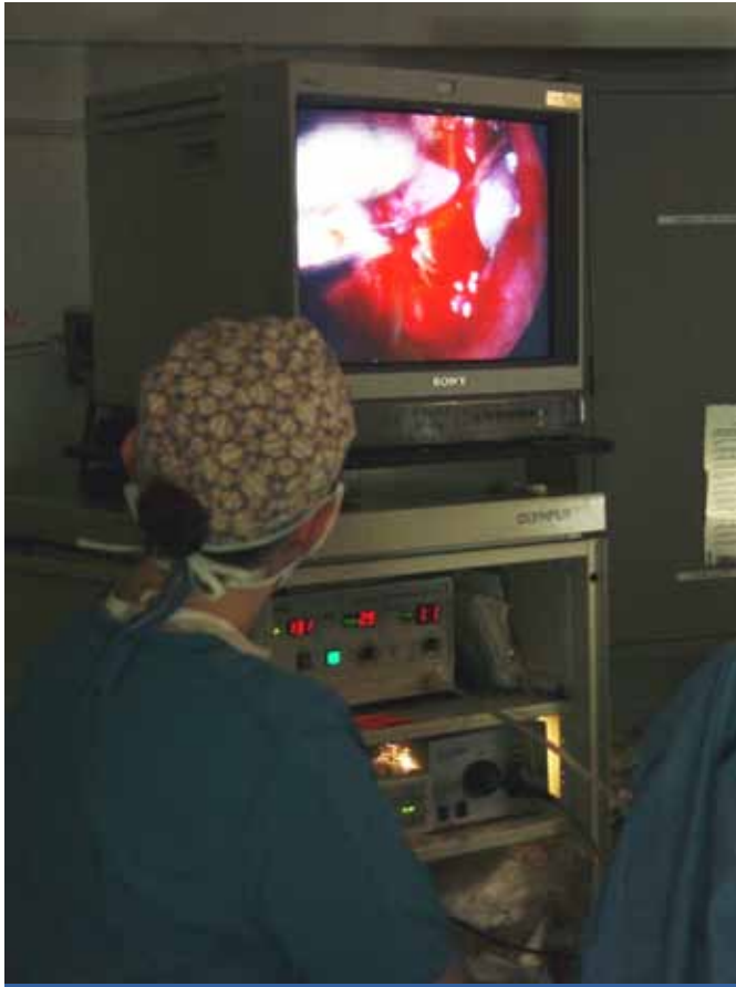
An appendectomy is observed on a laparoscopic monitor