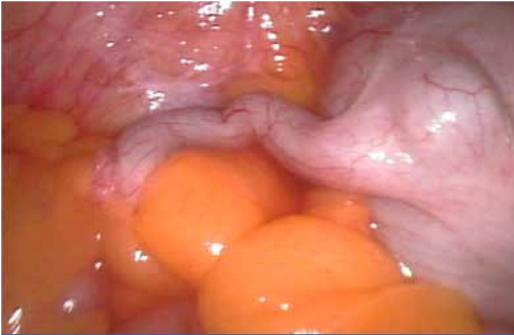
Before the removal of the appendix

Once it is determined that cancer is present in the appendix a course of action is chosen. If the tumor is a carcinoid and less than 1 centimeter in size with no metastasis, then an appendectomy is usually performed as this approach has