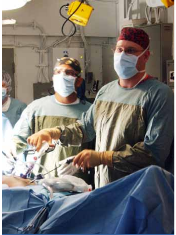
Surgeons watch the laparoscopic monitor while performing an appendectomy