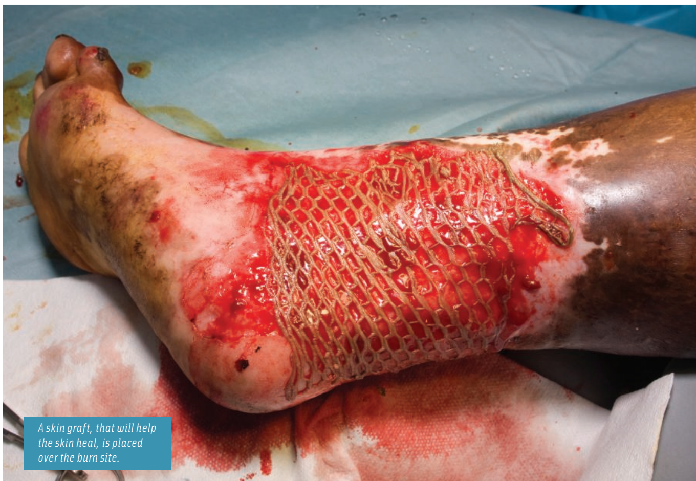
A skin graft, that will help the skin heal, is placed over the burn site.

to be 85 to 100+ degrees for burn patients, due to the patient having their body exposed in large quantities.