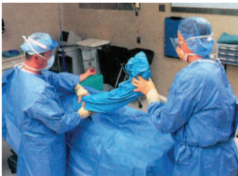
Courtesy Thomson Delmar Learning. Surgical Technology for the Surgical Technologist: A Positive Care Approach. ©2004.

Approximately 35 cm of saphenous vein were exposed for graft procurement. The surgeon used a right-angle clamp, a mosquito clamp and a vessel loop to isolate the proximal end of the exposed saphenous vein.