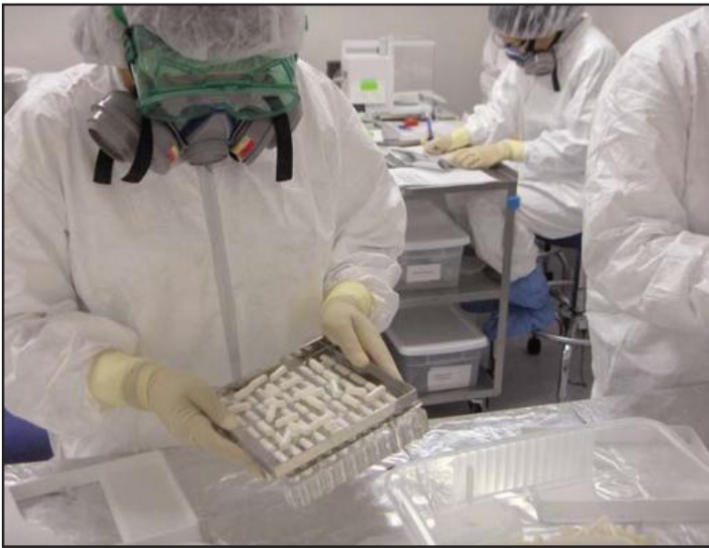
Lab technicians prepare a new drug for a clinical trial.

The preclinical testing of a drug under development may involve research that includes hundreds or thousands of existing compounds or new chemical entities. A new chemical entity (also known as new molecular entity) is a drug