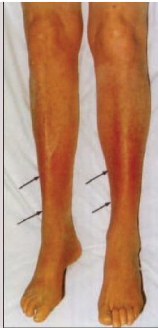
An erythromelalgia flare-up is indicated on both shins.

There is evidence that suggests that erythromelalgia shares a common pathophysiology with Raynaud's Syndrome. In some instances, a patient has exhibited both conditions – sometimes simultaneously. Despite this possible relation, there is no evidence to suggest that the ETS procedure can have a positive impact on EM patients. 5