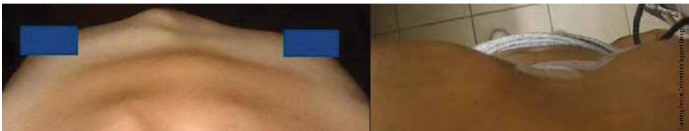
Superior view of a 20-year old female before and after having her pectus carinatum surgically repaired.

Once the patient is positioned, the circulator performs a skin prep on the patient's chest, beginning at the incision site and extending out to each side contralaterally, from chin to umbilicus, down to the table sides. Povidone-iodine solution is used as the skin prep agent. During this time, the surgeon and resident proceed out of the operating room to perform a surgical scrub, after which the ST assists them