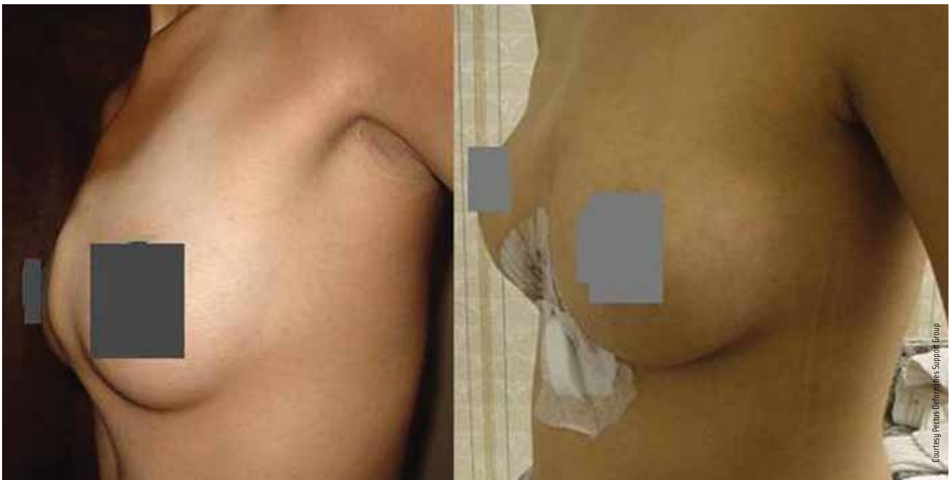
A lateral view of a 20-year old female before and after having her pectus carinatum surgically repaired.

Additional sterile items pulled for the procedure include bone wax, adhesive skin closure strips, suction tubing, cord