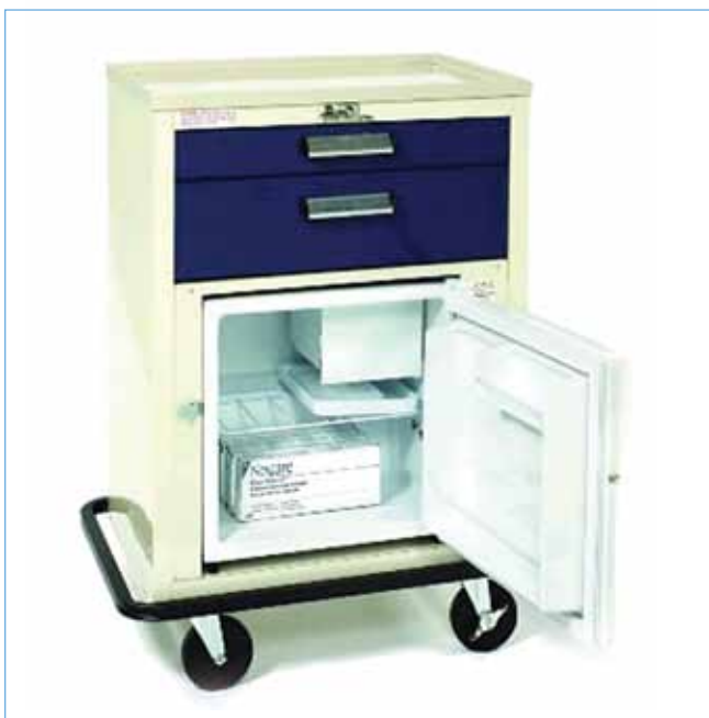
MPD Malignant Hyperthermia Cart with Refrigerator

A vial of dantrolene sodium contains 20mg of the drug, as well as 3000mg of mannitol and sodium hydroxide,