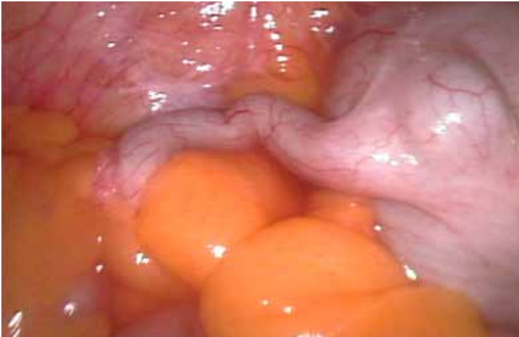
Before the removal of the appendix

Once it is determined that cancer is present in the appendix a course of action is chosen. If the tumor is a carcinoid and less than 1 centimeter in size with no metastasis, then an appendectomy is usually performed as this approach has