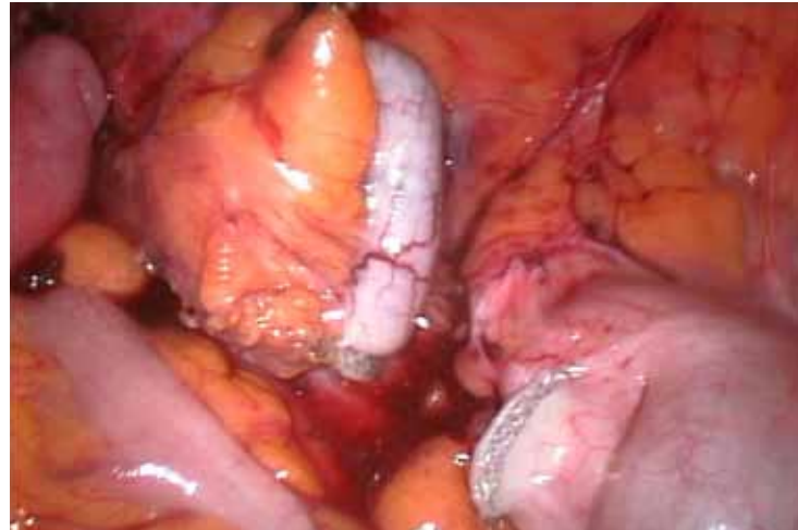
At the removal of the appendix

cancer is found. Intermittent pain in the lower right quadrant in the initial stages, followed by continuous pain and abdominal tenderness are some of the first symptoms that may be noticed. Most neoplasms are found once the appendix has been removed and sent to pathology for analysis. 7,8 Signs and symptoms of adenocarcinoma of the appendix prior to stage IV development are difficult to track as most cases are asymptomatic. Even in advanced disease sometimes the only symptoms are abdominal discomfort and bloating.