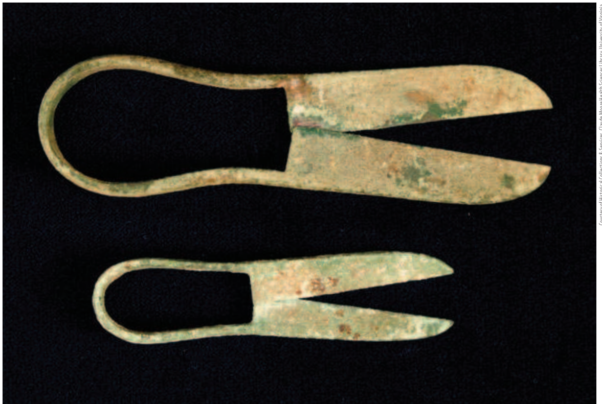
FIGURE 3: Surgical scissors