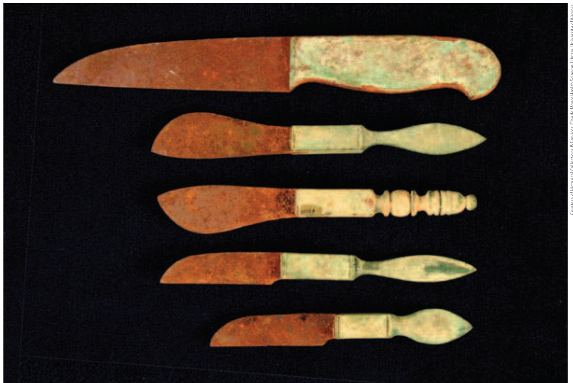
FIGURE 1: Scalpels