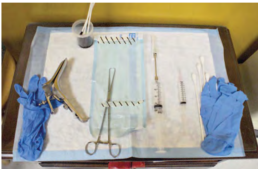
This is the nonsterile working table. This is the portion of the procedure where the physician injects the local anesthetic.

be placed in an accessible location for the surgical technologist and surgeon. Once the nonsterile field is established, a sterile area needs to be created. A Mayo stand covered with a sterile impervious drape and towels is ideal. The Mayo stand will hold the scope, white balanced and ready to go, and cervical dilators. Right before the patient comes to the room, a pre-warmed bag of normal saline needs to be hung on an IV pole in a pressure bag and hooked up to the irrigating system.