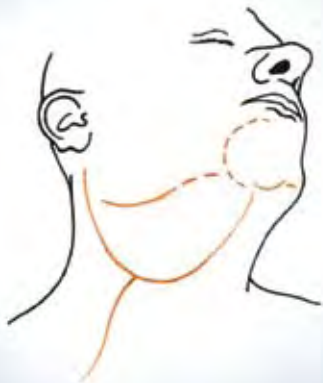
Incision used for unilateral supra-omohyoid neck dissection