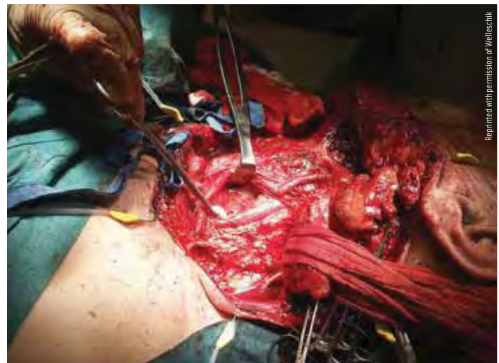
Radical Neck Dissection

When reconstructive procedures are performed, the method used depends on the surgical defect. The surgical wound may be closed primarily or with split-thickness skin grafts. Local flaps may be used. These skin grafts are used for facial or intraoral defects. For nasal and facial defects, full-thickness skin grafts are used. The pectoralis major musculocutaneous flap is an example of a regional flap. The radial forearm flap, free jejunal flap and rectus abdominis flap are used for microvascular tissue transfer. The iliac crest flap is used for microvascular osteocutaneous flaps. All of these flaps are used to restore function and cover defects. The grafts and flaps listed above are performed when it is deemed necessary due to large defects that are created. When microvascular flaps are used, surgical and anesthesia time increase significantly. This is because veins and arteries are connected