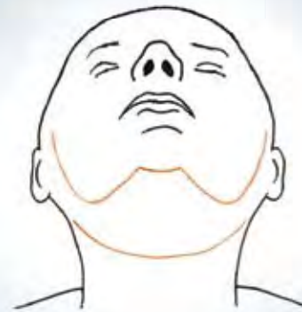
Incision used for bilateral supra-omohyoid neck dissection