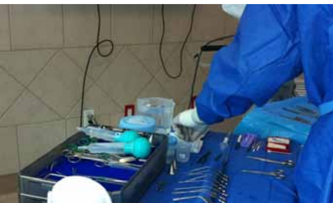
Back table setup

the circulating nurse wrote on a dry erase board how many sponges, sharps, vessel loops and umbilical loops were counted so that it could be easily seen throughout