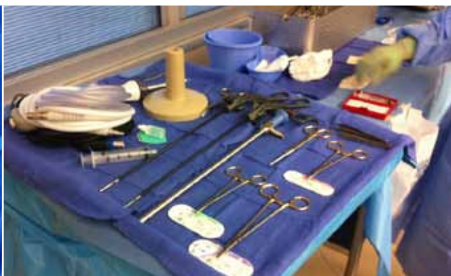
Back table setup

After all needed supplies were opened onto the back tables, the surgical technologist went outside of the OR to the sink area to perform a surgical hand scrub. A 10-stroke surgical hand scrub was performed and the surgical technologist proceeded back into the OR carefully so not to contaminate herself, dried her arms and donned the surgical gown and gloves. The surgical technologist approached one of the back tables and began to organize the sterile field. Two sterile sheets were draped over both of the back tables. The