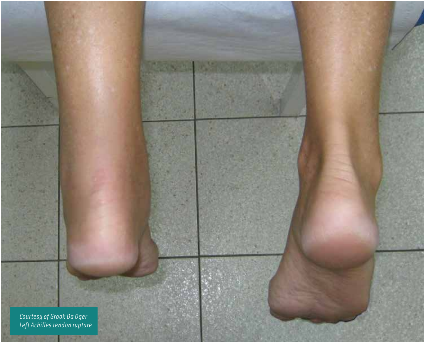
Left Achilles tendon rupture

sutures and a 4-0 polyglactin 910 suture passed on a needle driver. The ends will be cut with Mayo scissors. The skin will be closed using vertical mattress retention sutures. A bupivacaine solution will be injected in and around the wound to help with post-operative pain. The area will be cleaned and the dressings will be applied. The foot will be held in a plantar flexion position to avoid unnecessary strain on the newly repaired Achilles tendon. A light pressure dressing will be applied to the incision site and the ankle will be wrapped with cotton padding from superior to the incision to the toes. A splinting material will be moistened with warm saline and placed on the posterior aspect of the lower calf, ankle heel and foot. It will be formed to the natural shape of the leg and foot and allowed to harden