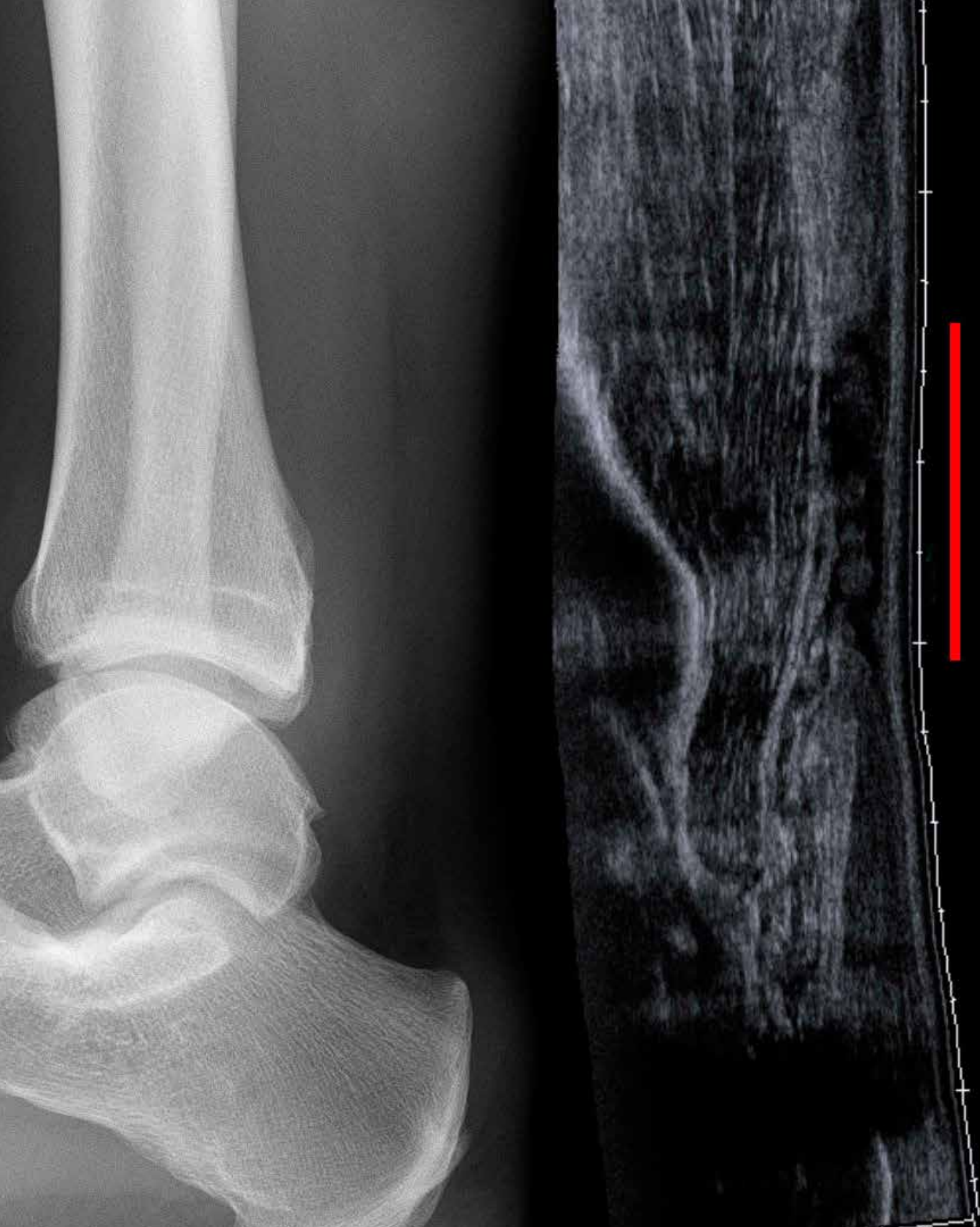
Achilles tendon rupture seen at sonography: discontinuity over several centimeters.