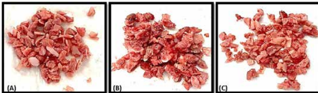
Figure 2: Photographic examples of 25g porcine bone sample following removal of soft tissue. (A) Automated Clean Sample (B & C) Manually process by expert scrub techs.

minutes, \pm 14 minutes. After cleaning, the bone samples moved directly to manual milling, which required 17 \pm 13 minutes. The variability across participants was \pm 20 minutes for overall processing (Figure 1, Table 1).