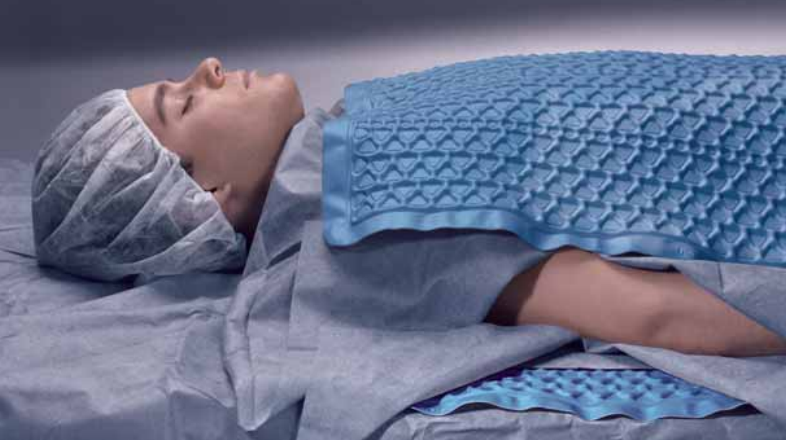
FIGURE 1 A hyper-hypothermia blanket can be placed over the patient, or between the patient and mattress.