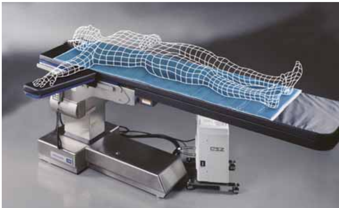
PHOTO Plasti-Pad® Plus reusable hyper-hypothermia blanket.

Maintaining proper room temperature is a major way of preventing hypothermia in the surgical patient. Because of various surgical specialty necessities previously discussed, the room temperature is lowered. This may not be a problem if warming devices are added to the patient in exchange for lowering of the room temperature. It is important to remember the AST motto