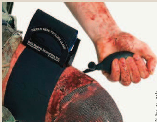
Emergency & Military Tourniquet (EMT)