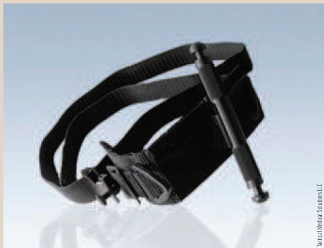
Special Operations Force Tactical Tourniquet (SOFTT).