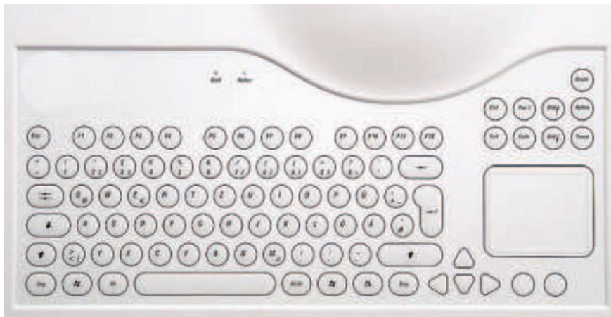
Autoclavable keyboards are easier to disinfect than standard keyboards.

Laminar air flow, which is a form of positive pressure ventilation, is used in many health care facilities to decrease the rate of air exchange from the semi-restricted area of the outside hallway to the operating room. Additionally, traffic in the operating room should be kept to a minimum while a procedure is in progress to prevent contaminants from becoming airborne, thus reducing the contact patients have to airborne microbes and fomites, as discussed and described in AST's Recommended Standards of Practice for creating the sterile field. 10 Disinfectants used in the