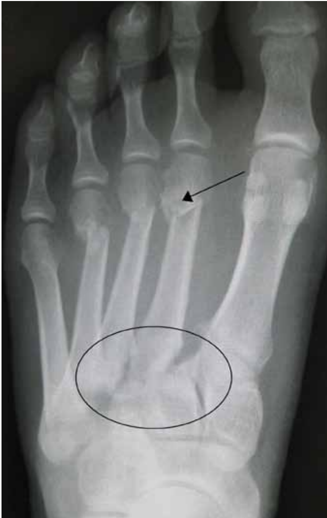
Traumatic Lisfranc fracture with fractures of the 2nd to 4th distal metatarsals