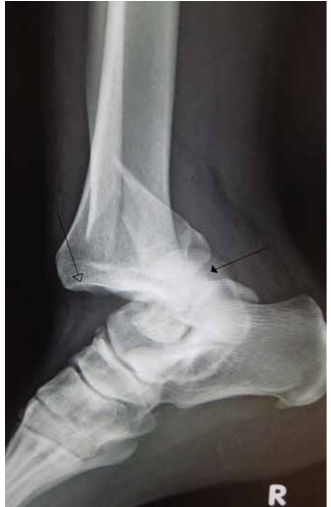
James Heilman, MD A traumatic dislocation of the tibiotalar joint of the ankle with distal fibular fracture

cess fractures and compression/burst fractures. Cervical fractures are also common and can present challenges as how to administer care. Jumped facets, spinous process fractures and cervical body fractures are the most identifiable. Nerve injuries also occur in rodeo athletes and acute injuries are usually associated with fractures. 4